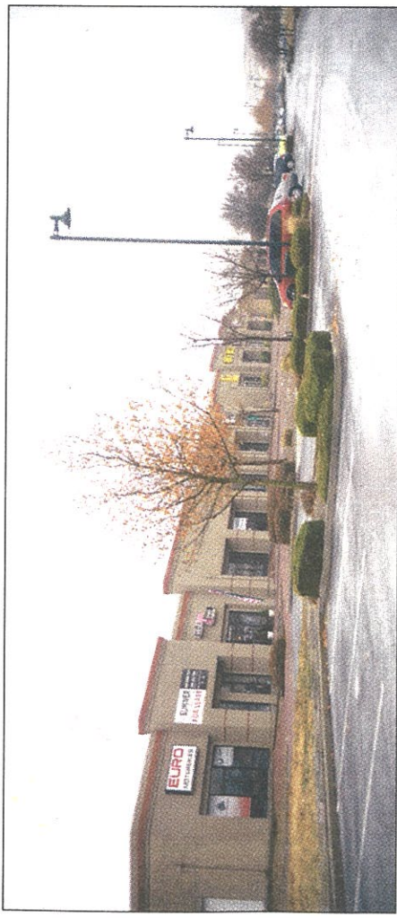
1st Street businesses that are paying the CFD town improvements.

Wants judge to review language in town code