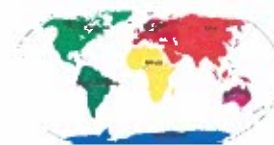
The Seven Continents

"A leader is one who knows the way, goes the way, and shows the way." John C. Maxwell